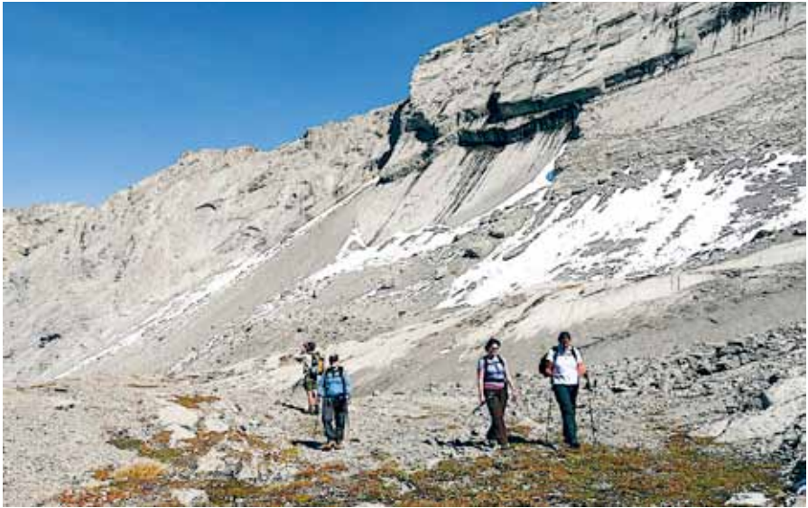
South Burstall Pass area below Whistling Ridge.

up and wade the creek easily at the outlet to Third Burstall Lake.