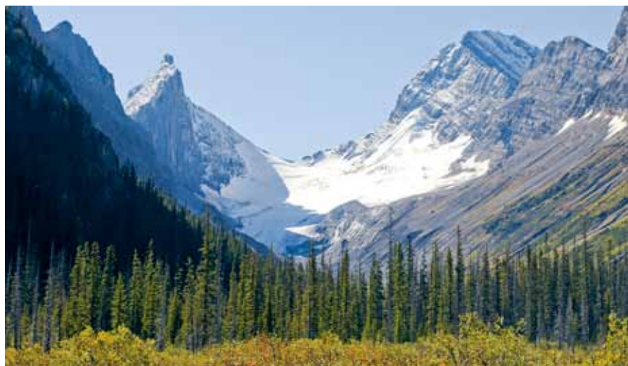
Mt. Robertson, Robertson Glacier and Mt. Sir Douglas from the flats.

entails following footprints in the gravel and signs on posts. During the summer glacier melt, paddling continually shifting braided streams is the norm.