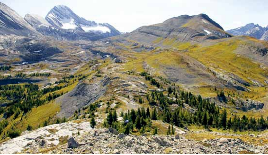
Burstall Pass (centre) from the lower south ridge of Snow Peak. To left is South Burstall Pass below Sir Douglas. At centre ridge 147230, showing both ascent and descent routes. To the right is Lemnan Lake between mounts Lemnan and Leval. The pointy peak is Talon Peak above Talus Lodge.

into a holding pond, diverted from its natural course into Smith-Dorrien Creek to Mud Lake, a receptacle for all the muck carried down from the Robertson and French glaciers. At another hiking sign curve left up a hill. (To right is the flat Hogarth Lakes logging road.) At the top is a four-way junction. Turn sharp right at the hiking sign. (Ahead is the French Creek logging road.)